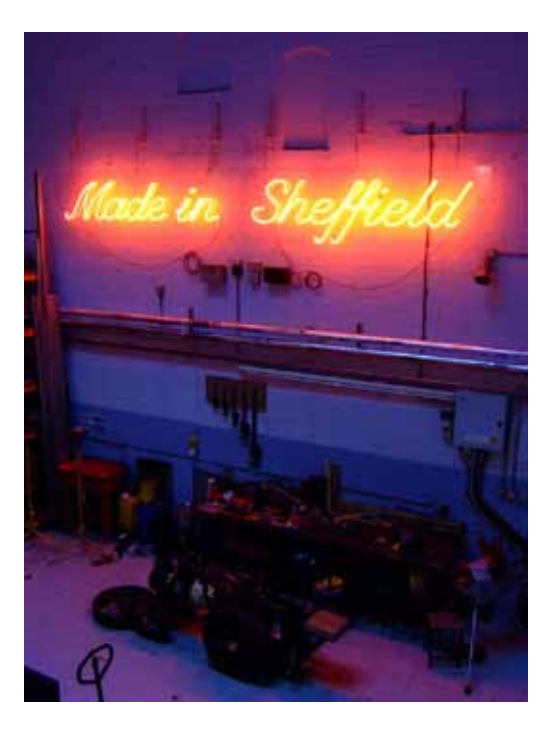
Kelham Island neon sign

Brand new developments house students and professionals, along with small supermarkets, pubs and popular restaurants. The power station building is back in action as well, this time as the Kelham Island Museum, housing a wide range of exhibits on steel production, steam power and wartime Sheffield.